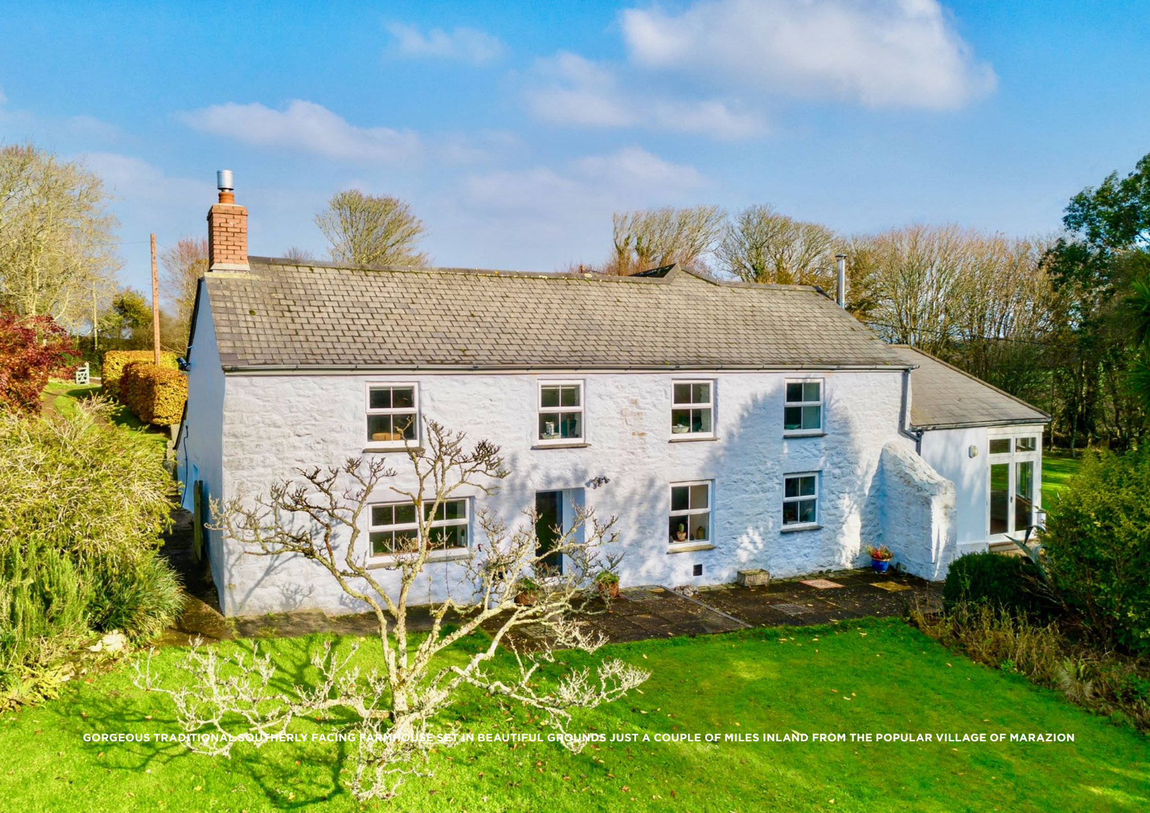
GORGEOUS TRADITIONAL SOUTHERLY FACING FARMHOUSE SET IN BEAUTIFUL GROUNDS JUST A COUPLE OF MILES INLAND FROM THE POPULAR VILLAGE OF MARAZION